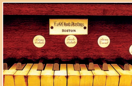
The 1875 E. & G. Hook & Hastings. The largest extant 19th century organ in Chicago.