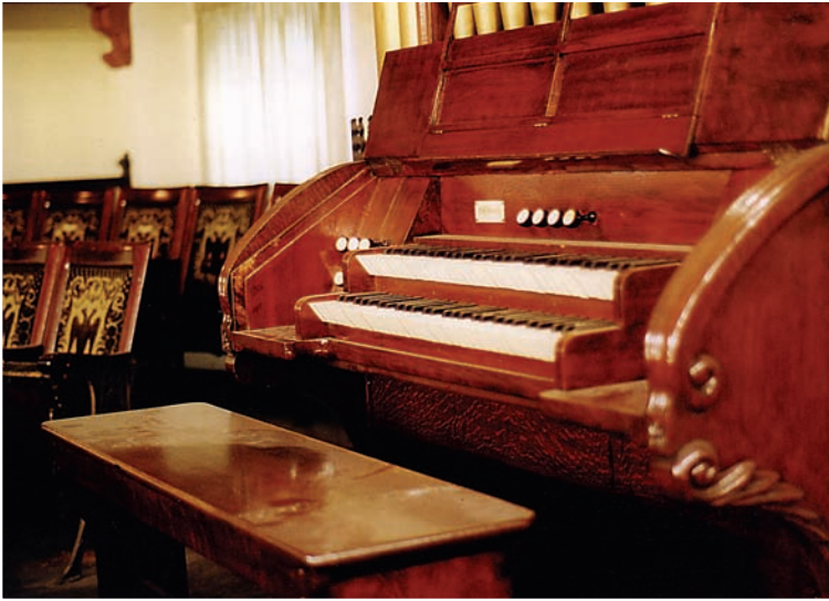
The Kimball organ in the Small Preceptory. Note the detailed carving on the keydesk.